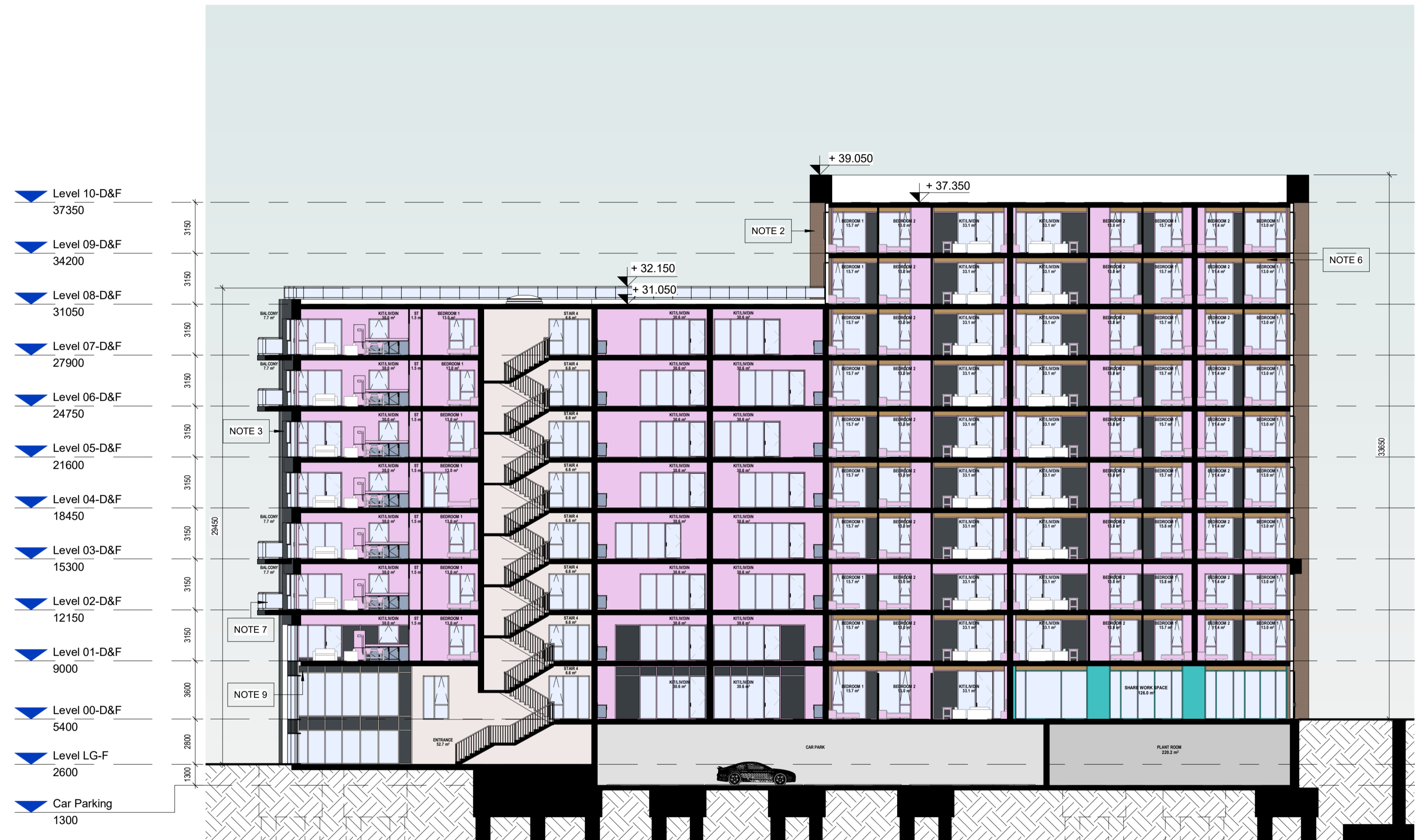
1 BLOCK F-SECTION B-B 1 : 200